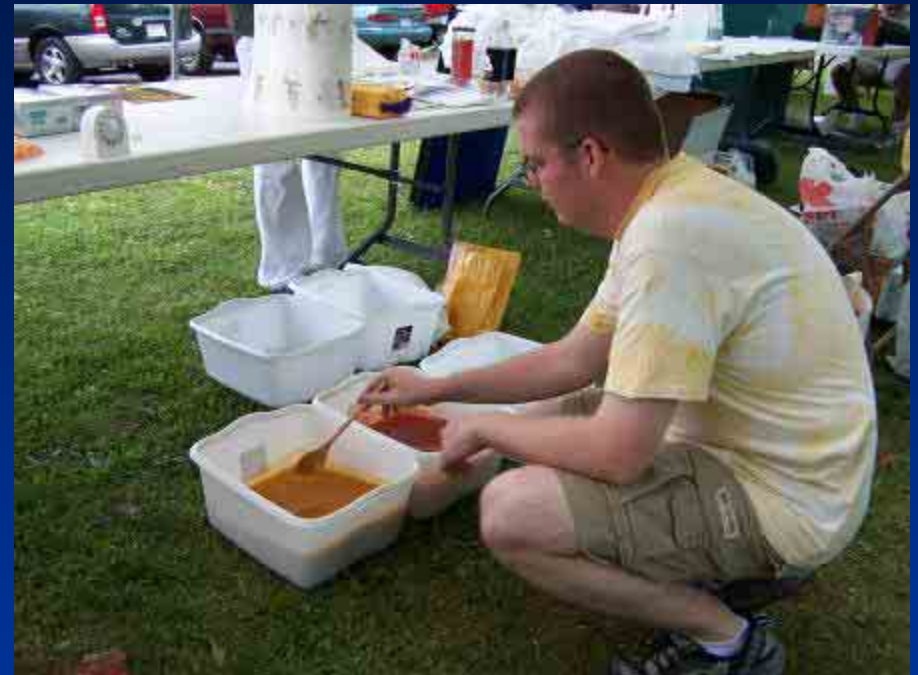
Tie Dying with Acid Mine Drainage