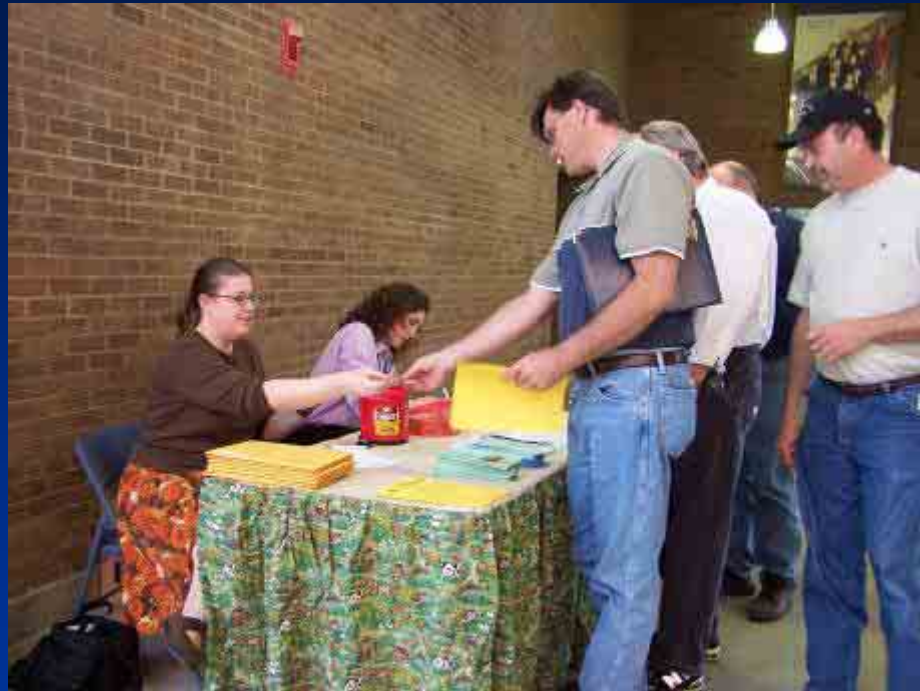
Landowner Development Workshop Series